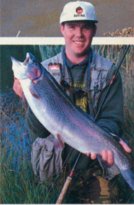
DECEMBER 1996 TROUT FISHERMAN